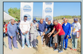
I Meya namakhansela behlaba isoyi