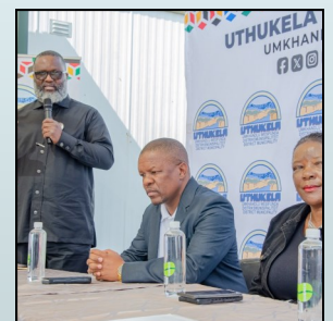
Inkosi Buthelezi ibonga ngenkathi Inkosi Shabalala noSomlomo uNqubuka belalele