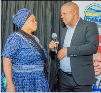
Umeya elumana indlebe nelunga lomphakathi