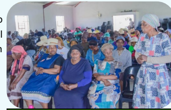
Community members in attendance