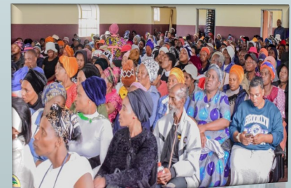
Community members packed the hall