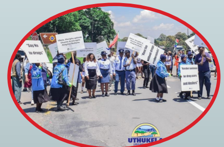
Various stakeholders partaking on the march