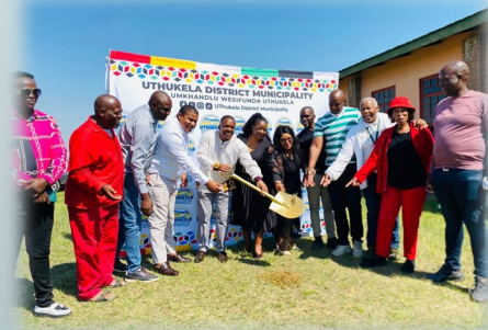
Mayor and Councillors during a sod-turning ceremony